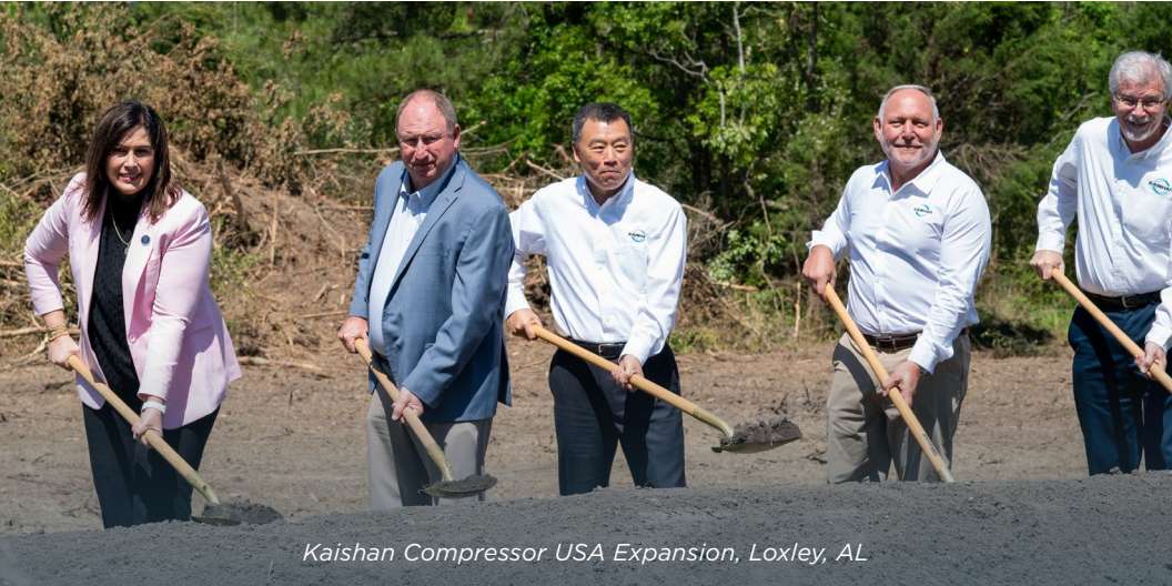
Kaishan Compressor USA Expansion, Loxley, AL