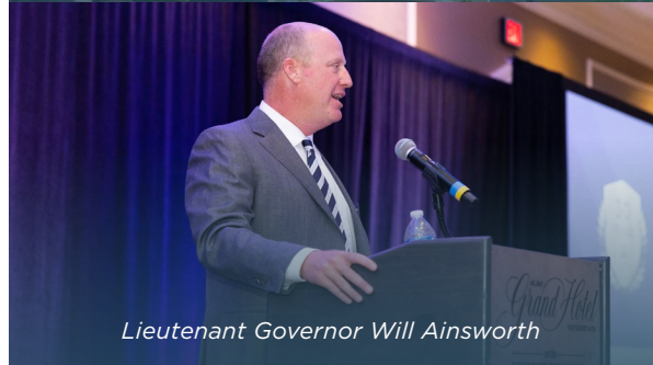
Lieutenant Governor Will Ainsworth